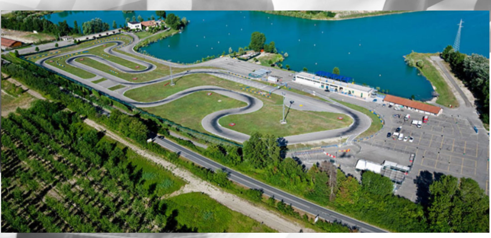
Il circuito 7 Laghi Kart di Castelletto di Branduzzo (PV) visto dall'alto

All drivers will have a hospitality area and an area equipped with lockers and changing rooms at their disposal.